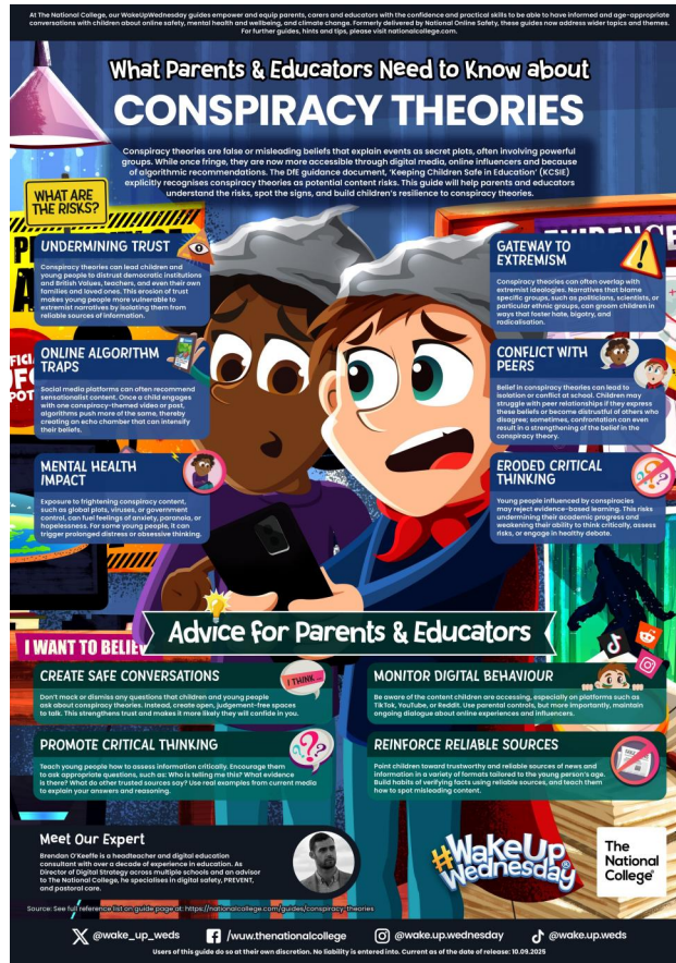
1 - Guidance for parents on Conspiracy Theories