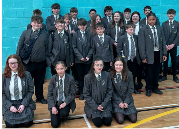
1 - Pupils embraced the day and opted to wear Autism badges to show their acceptance and support. It was fantastic to see pupils showing kindness to others, including staff, and promoting the school's values throughout the day.